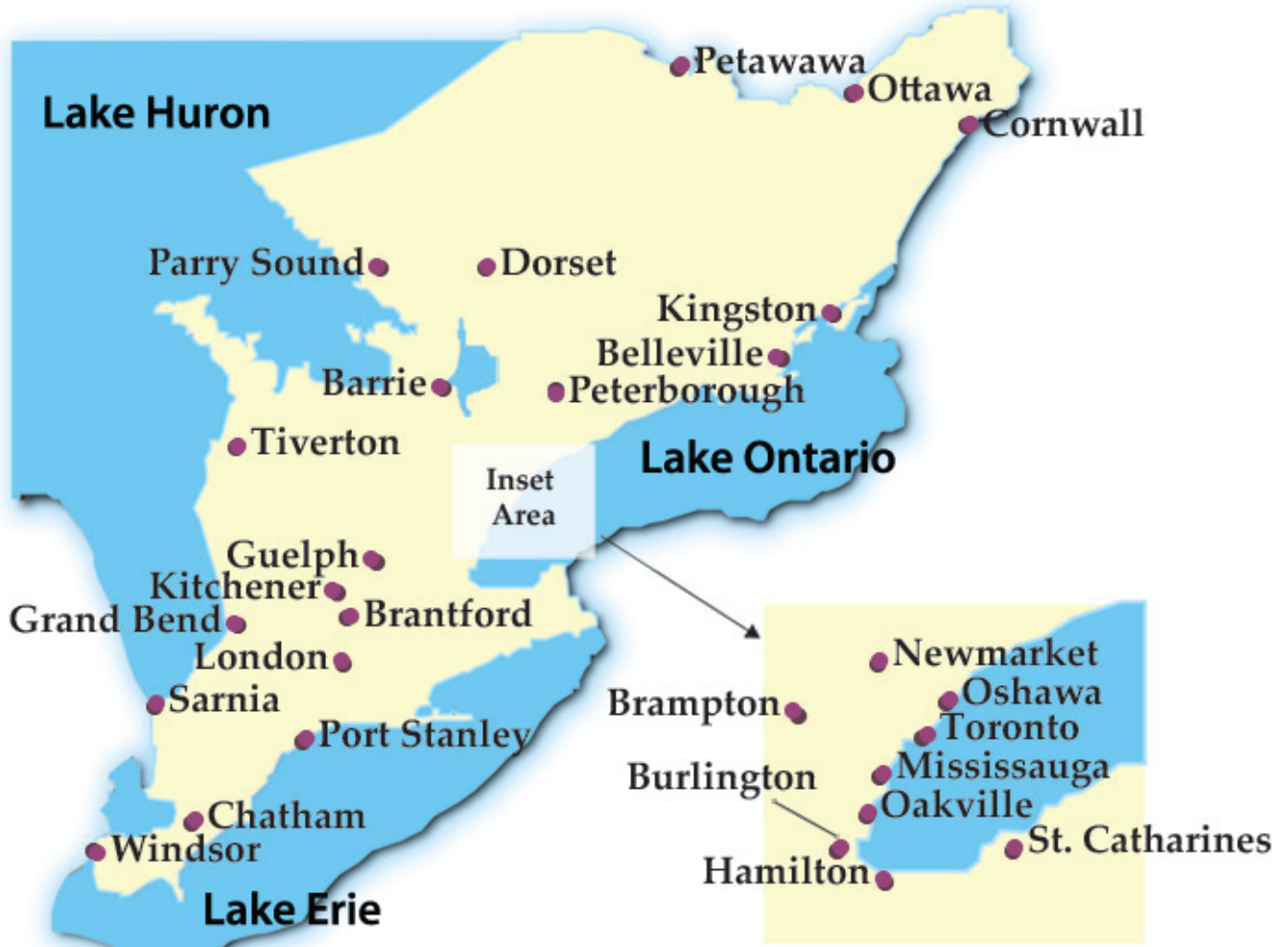
Southern Ontario Cocaine Anonymous Area 2017